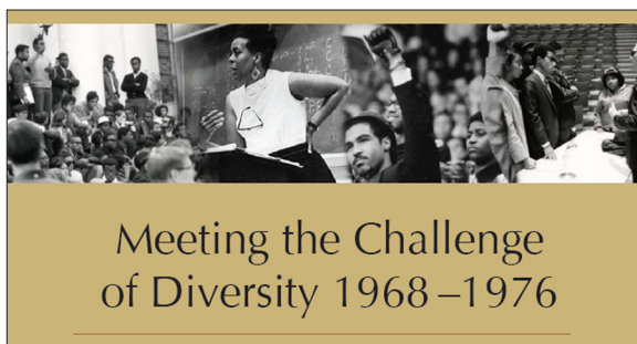
Cover of the History of IED, located online at www.ugst.umd.edu