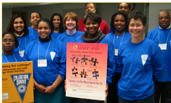
UM-EOC staff and volunteers at College Goal Sunday 2010

Following on the heels of Community Opportunity Day was College Goal Sunday 2010, hosted for the second consecutive year on Sunday, February 21st at the Prince George's Sports and Learning Complex. More than 100 local high school seniors, parents, and adults with college aspirations attended to get hands-on help in completing their Free Application for Federal Student Aid (FAFSA). Over twenty-five volunteers from partner organizations attended to lend their assistance, including representatives from the U.S. Department of Education, the Maryland Higher Education Commission (MHEC), the U.S. Census Bureau, the Prince George's