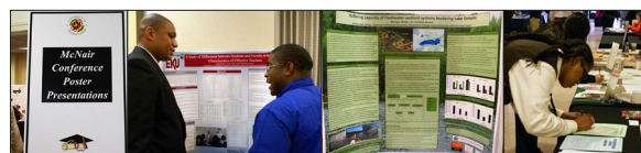
The 11th annual National Conference for McNair Scholars and Undergraduate Research